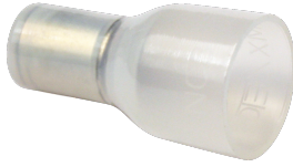
Part Number NC-8