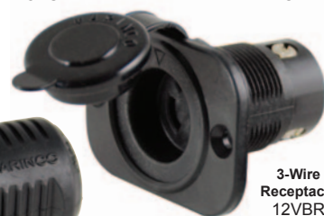
3-Wire Receptacle 12VBR