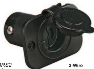
2-Wire Receptacle 12VBRS2