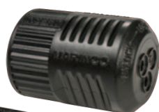
Cover 300251 for two or three wires