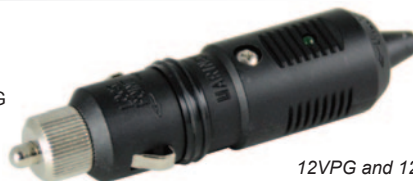
12VPG and 12VRC also sold as a set Set Part Number 12VPK