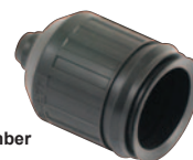
Part Number 6017 for 15A and 20A Straight Blade and 15A Locking Plugs