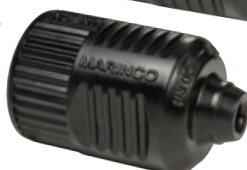
3-Wire Plug 12VBP