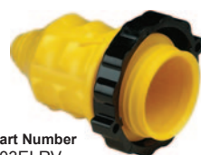
Part Number 103ELRV for 20A and 30A female connectors