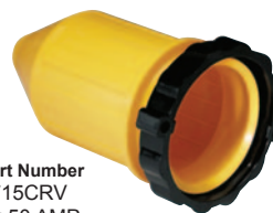
Part Number 7715CRV for 50 AMP female connectors