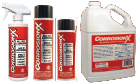
16 oz. Trigger Spray 91002 16 oz. Aerosol 90102 6 oz. Aerosol 90101 Gallon 94004

Polar Wire Products is an authorized distributor for Corrosion Technologies. For the complete line of CorrosionX® products, visit www.corrosionx.com