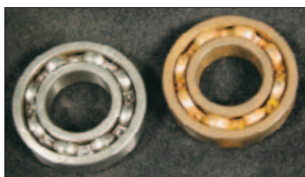
The bearing on the left was treated with CorrosionX; the one on the right was left untreated. Both were sprayed with seawater every day for two weeks. Note the remarkable difference.

CorrosionX® Heavy Duty forms a dripless, non-hardening, self-healing film that stubbornly resists removal by splash or spray—even full saltwater immersion. It penetrates rust and corrosion, removes moisture, stops electrolysis, then seals.