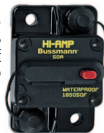
185 Series HI-Amp Panel Mount Part Number CB185P-50