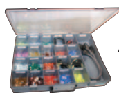
Circuit Breaker and ATC/ATM Fuse Service Kits available—see page 89