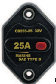
255 Series Mid-Range Part Number CB255-25

255 Series Switchable Manual Trip Push-Button Mid-Range Breakers are rated from 10 to 50 amps. Use in marine, agriculture, construction, RV, chassis and specialized equipment market applications.